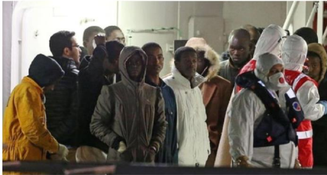
Survivors of last Sunday's sinking off Libya arrived in the Sicilian port of Catania late on last Monday

The Tunisian captain of a boat that capsized off Libya on Sunday, killing hundreds of migrants, has been charged with reckless multiple deaths, Italian officials say. He has also been charged with a Syrian member of the crew with favouring illegal immigration.